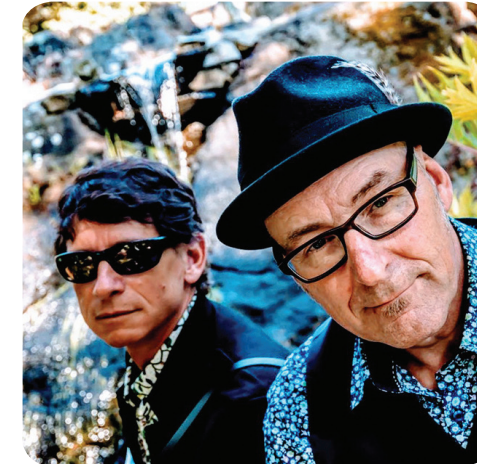
12:00 PM - The Clifles